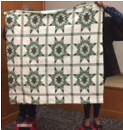
Mystery Quilters. PEEK A BOO, CAN'T SEE YOU