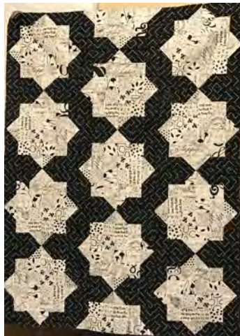
Di Nyce Brooks-Gough