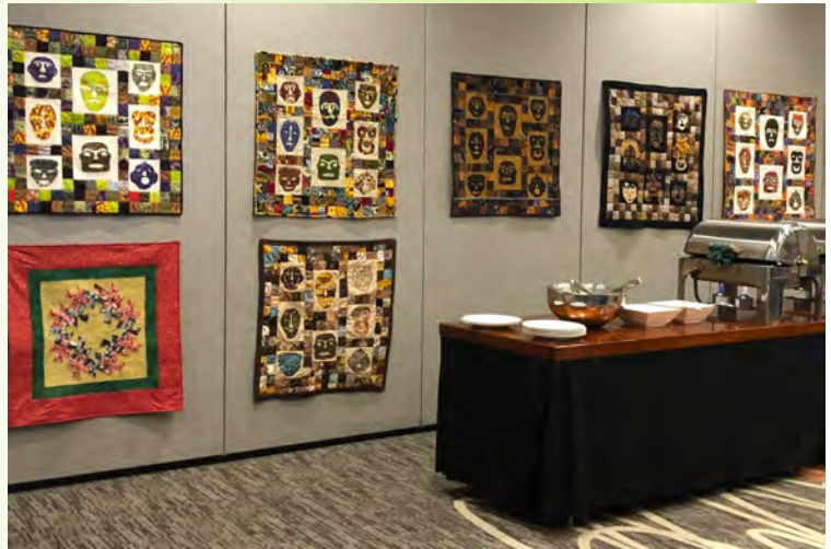
Block-of-the-Month Mask quilts adorned the walls.