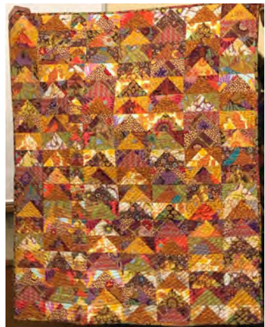
Di Nyce Brooks-Gough