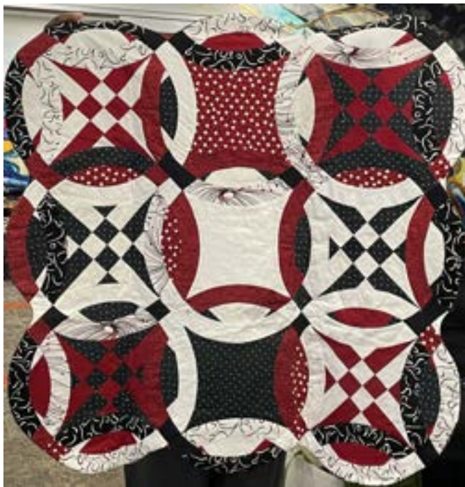
Brenda Ames' third and final UFO is completed!