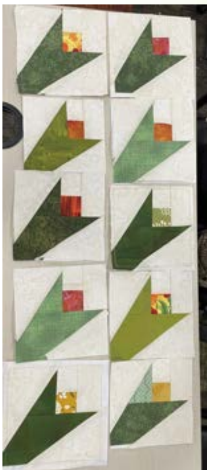
Success! Beautiful paper-pieced lilies.