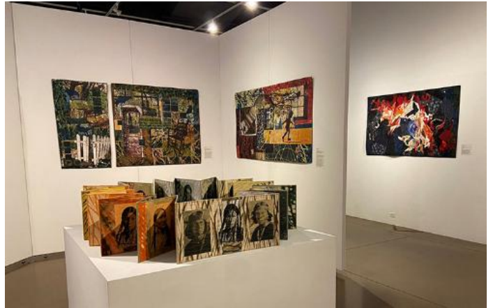
Photo: The 40th Annual New Legacies: Contemporary Art Quilts exhibit is shown above.

Art quilts accepted for exhibition will exemplify innovation in quilting and surface design techniques as well as excellence in artistic composition and craftsmanship. The goal of the exhibition is to recognize the world's finest contemporary quilt artists and to advance the art form.