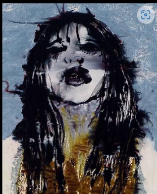
Reality - detail 32 x 56 Monoprinted on cotton fabric using plastic and thicken dyes

QUAKING ASPEN QUILT GUILD All events at Boulder Valley Christian Church (BVCC), 7100 S. Boulder Rd, Boulder.