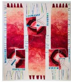
Flow by Peter Byrne